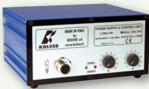
EDU1BL/SG Control unit with signals

All Kolver screwdrivers work in combination with a control unit acting as an AC to DC transformer and torque controller. The electronic control circuit cuts the power supply to the motor as soon as the pre-set torque has been reached. The EDU1BL, and EDU1BL/SG control units for KBL screwdrivers feature maintenance free state-of-the-art electronics with no wearing components. They come standard with the torque knob to adjust the torque (from 60% to 100%) of current control tools and a green LED which indicates when the control unit is on. EDU1BL/SG control unit works with KBL..FR/S or KBL..FR/CA and it additionally features signals for reached/not reached torque, pressed lever and remote start/reverse. A double output connector (Dock02 or Dock02/S for models with signals) is also available for operators using two screwdrivers at the same time. KBL..FR screwdrivers work in combination with our standard EDU1FR controllers. This option will allow existing customers to replace FAB & RAF drivers with no need to replace controllers.