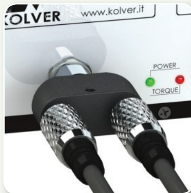
DOUBLE OUTPUT CONNECTOR FOR KBL

A double output connector is available for operators using two KBL screwdrivers in the same working area. Model DOCK02 (code 020035) is meant to be used with KBL..FR, while model DOCK02/S (code 020035/S) is to be used with KBL..FR/S (with signals) or KBL..CA (for automation). The two screwdrivers can be used at the same time.