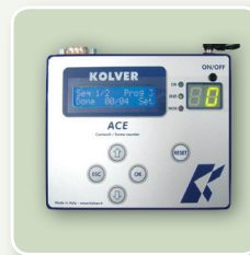
ACE SCREW COUNTER (see page 24)