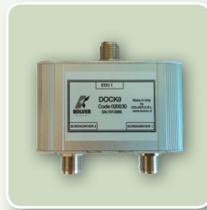
DOUBLE OUTPUT DEVICE Model DOCK 01