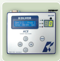
ACE SCREW COUNTER (see page 24)

FAB and RAF screwdrivers can be used with the new switching EDU2AE/FR as well! This means they can benefit from all of the 2AE features (screw counting option, autoreverse, run time etc).