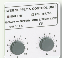
SOFT START AND SPEED REGULATION