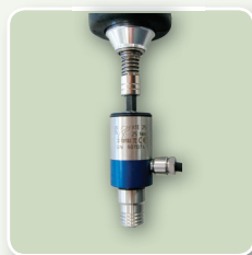
EXTERNAL ROTARY TRANSDUCER