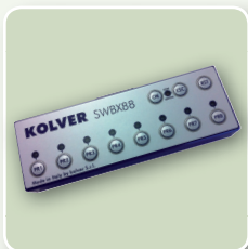
SWITCHBOX SWBX88 code 020033