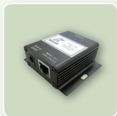
ETHERNET DEVICE code 020075

range. All units comply to norms 61000-6-2 and 61000-6-3 and therefore have better endurance in environments with high noise and interference levels. Improved EMC features are guaranteed thanks to solid steel base and back panel. The new features allow users to select a fast approach speed and a final tightening speed to adapt to any type of application and it is also possible to select an endless time of clockwise rotation for any application requiring no max time option. The new EDU2AE control units are now multilanguage: you can choose among English, Italian, German, French, Portuguese or Spanish. A wide range of accessories for remote programming and PC interface is available for the complete EDU2AE series.