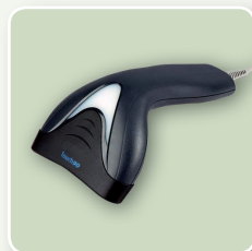
BAR CODE SCANNER code 020050