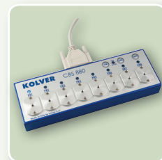
SOCKET TRAY CBS880 code 020042